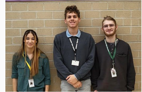
2023 Skills USA Participants