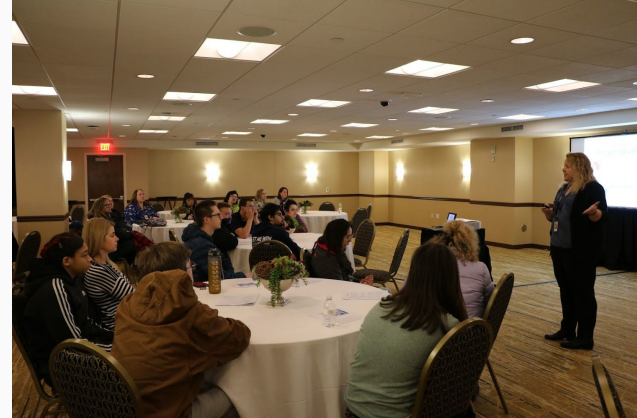
Open house for prospective student interns at Wind Creek Resorts